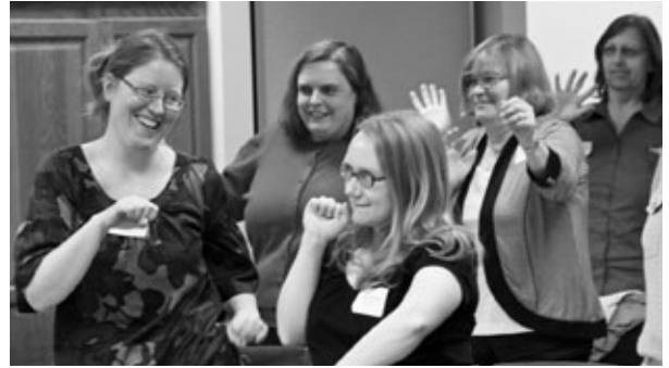
Conference attendees at work and play